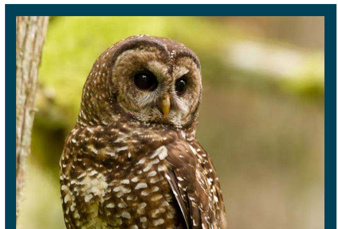
An endangered spotted owl looks out over their forest home. It's not too late to help heal the web of life and return back to a place of abundance.

The good news is that the B.C. government has committed to enacting this legislation and we plan to hold them to this promise in 2024.