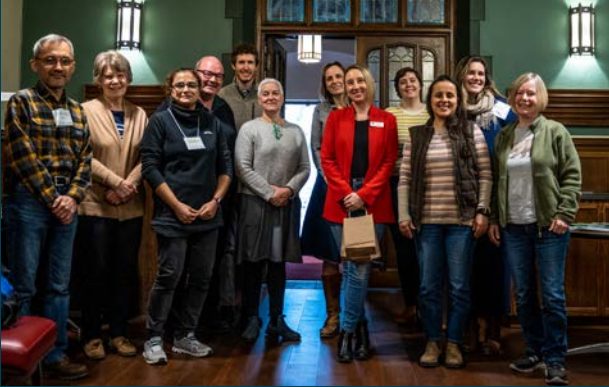
The first MTLLP meeting at St. Andrew’s Wesley United Church. This Christian faith cohort launched the program with us in February 2023.