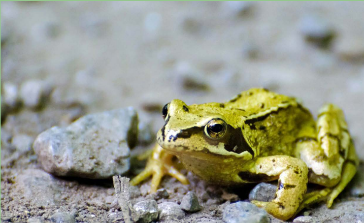
PACIFIC TREE FROG