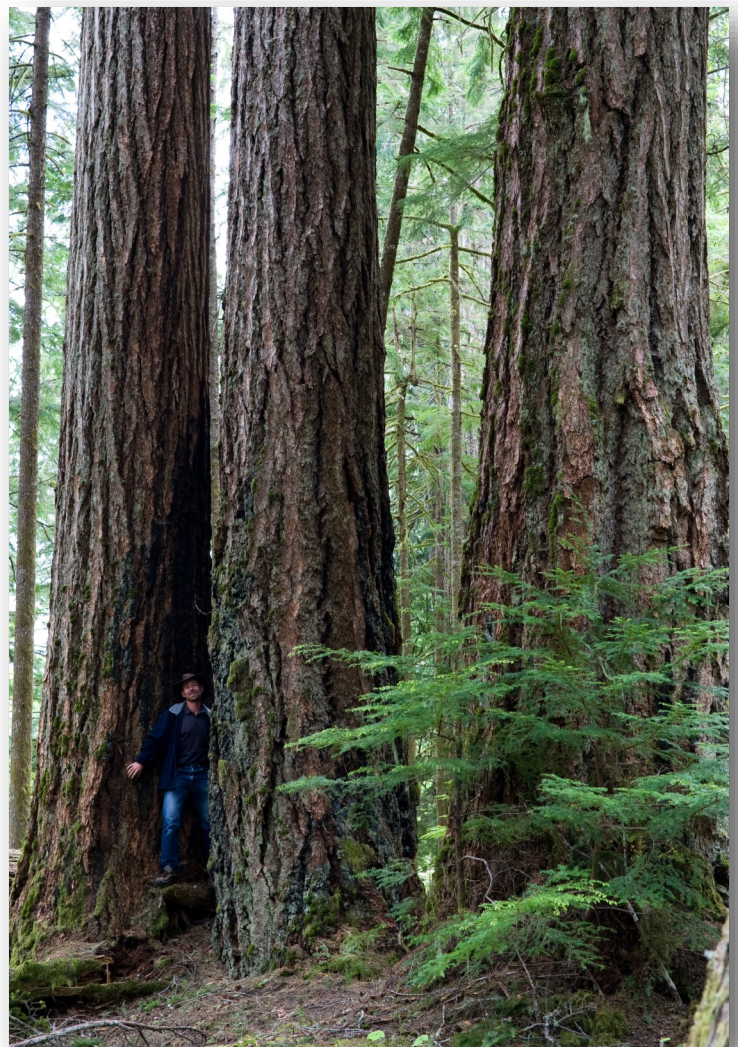
Unprotected old-growth Douglas Fir, Koksilah River Grove

Landscape units below 30 per cent old-growth are of the highest concern from a conservation perspective. At this threshold, a significant number of species show alarming population declines or species loss from the remaining suitable habitat (two thirds of species according to one review 7 ). In conservation planning, projects that focus on the question of how much of an ecosystem is needed to maintain functional landscapes have often called for much higher percentages (e.g. 57 per cent for Florida 8 ; 60 per cent in Oregon 9 ; 50 per cent for the boreal 10 ).