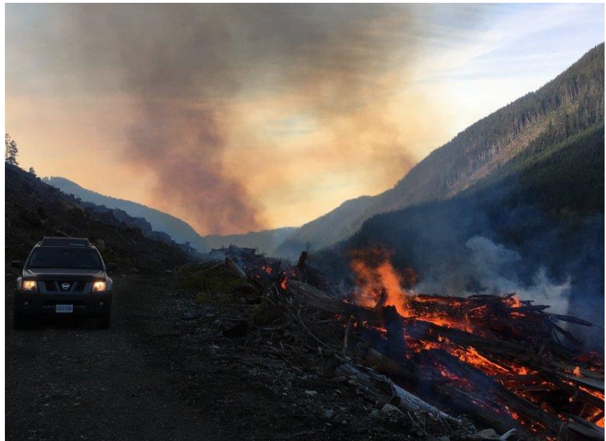
Burning slash from logging operations on Northern Vancouver Island, Nov. 2018.

The situation has gotten much worse in the last two years. Both the 2017 and 2018 wildfires burned more than 1.2 million hectares of the province, eight times more than the ten-year average. 4 B.C.'s 2017 fires caused an estimated 190 million tonnes of CO 2 emissions. 5 The number for 2018 is expected to be similar.