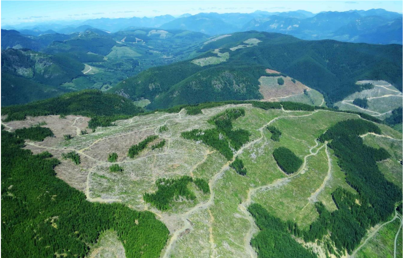
Extensive clearcuts near Cowichan Lake on southern Vancouver Island will release carbon for about 13 years.