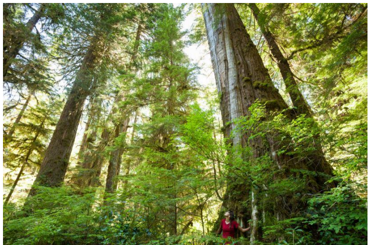
Walbran Valley, southern Vancouver Island.

B.C.’s forest management is making climate change worse—an alarming situation when our forests should instead be our best ally in the fight against climate change. Unless the B.C. government wakes up and takes far reaching action to strengthen conservation and improve forest management, provincial forests will continue to contribute to climate change instead of slowing it down. Sharing detailed information to inform forest climate strategies at all levels of government will be a crucial first step.