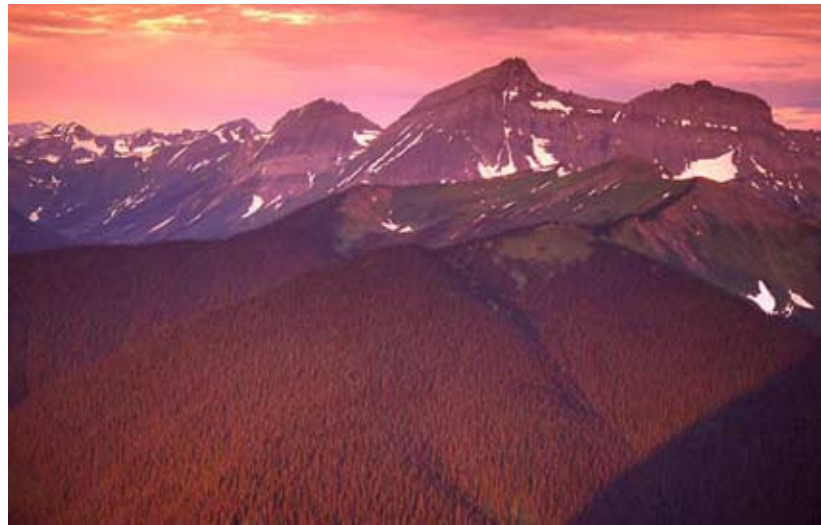
Goat River, B.C.

BC Gaming Policy and Enforcement Branch Government of Canada – EcoAction Government of Canada – Human Resources and Social Development Canada – Job Creation Partnerships Worksource Wage Subsidy Health Sciences Association of BC Resource Legacy Fund