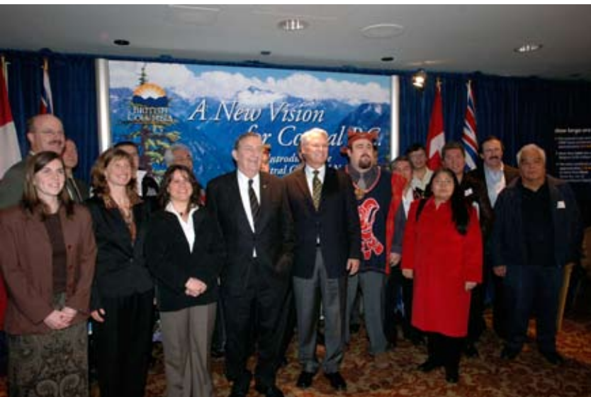
"The B.C. government, First Nations, environmental organizations and other stakeholders publicly announced the Great Bear Rainforest agreement."

Ten years in the making, through the ups and downs of markets campaigns and a complex land use planning process, this was truly a conservation achievement of global significance, a milestone of which we were all proud.