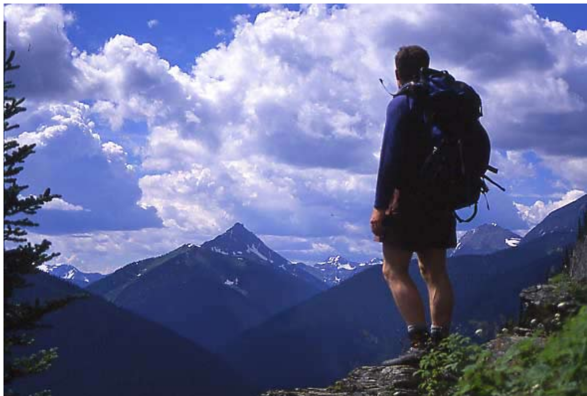
Goat River, B.C.

Sierra Club BC represents the regions of BC and the Yukon on behalf of the Sierra Club of Canada. The Executive Committee acts as the Board of Sierra Club BC and is composed of elected B.C. members as well as representatives of local groups. Sierra Club of BC Foundation is a separate organisation, with an independent board. Its primary responsibility is to raise charitable funds for the education and research work of Sierra Club BC.