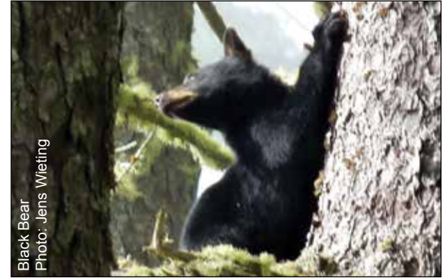
Black Bear