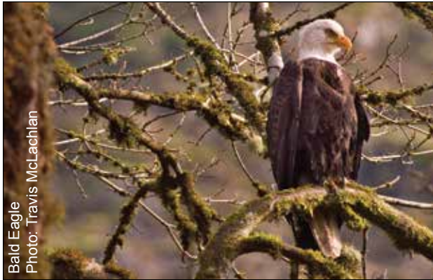
Bald Eagle