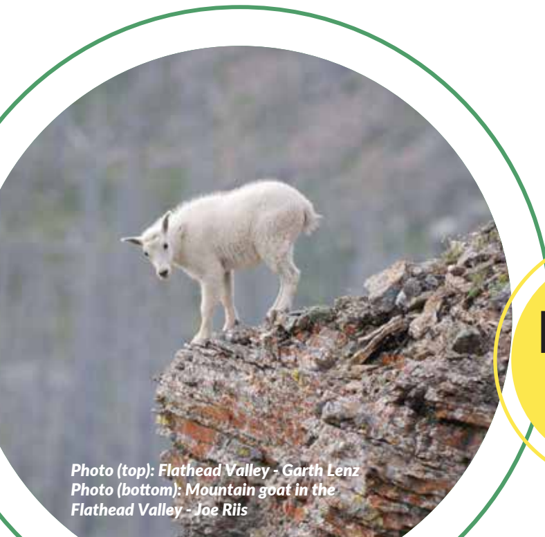
Photo (top): Flathead Valley Photo (bottom): Mountain goat in the Flathead Valley